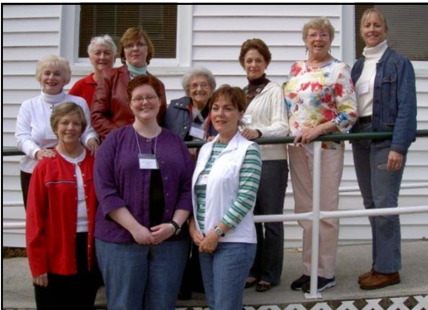
JJWMPC group attending PW Winter Retreat

Paul B. Johnson State Park near Hattiesburg