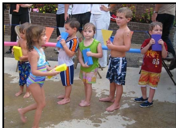
TRAFFIC CONTROL. Taking turns works most of the time.