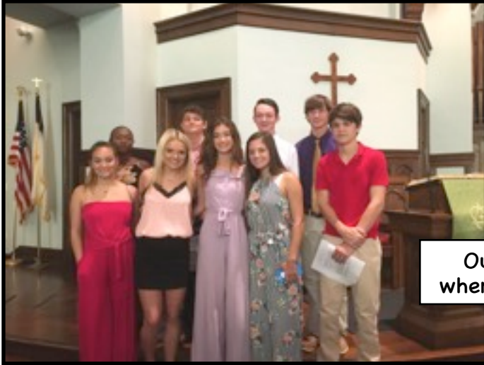
Our youth on a recent Sunday when they led our worship service.

celebration. There will be food, fun, and opportunity to meet with youth from other churches in our area with a little Bible study and worship along the way. Spread the word and plan to join us for this presbyterial youth event.