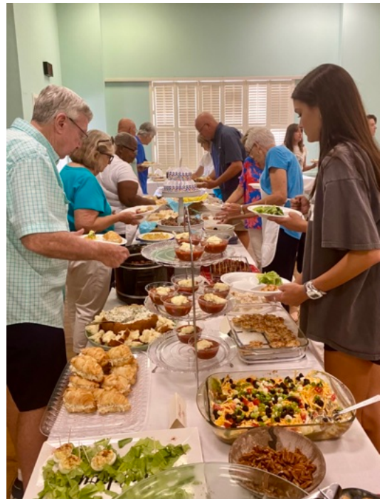
Everyone had a great time sharing their food and catching up with friends.